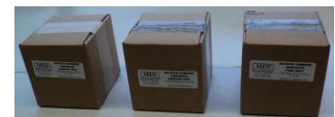
5 Pound Silicon Carbide Containers