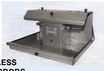
STAINLESS STEEL ARBORS

STAINLESS STEEL ARBOR WITH WATER FEED SYSTEM