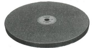
DIAMOND GRINDING DISC with BACKING PLATE

DIAMOND GRINDING DISCS are precision diamond discs bonded to a plastic backing plate. These discs offer a flat parallel grinding surface face for faceting, inlay, general lapidary and glass grinding applications. Also great for carbide and high speed steel tool grinding and shaping. Discs come with a 1/2" arbor hole.