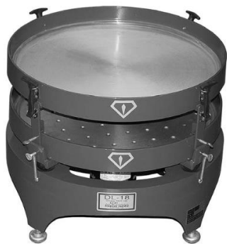
Diamond Pacific 18" Diameter DOUBLE DECK LAP MODEL DL-18

Some parts are still available for both the Lortone OLD model FL and NEW model OS VIBRATORY FLAT LAPS. Please call for price and availability.